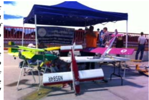
The static display had a variety of planes to check out, from the BCFO Star to floaters, they wowed the crowd!

land-locked planes and a couple floaters, along with the infamous BCFO-Star! Bryon's lit-up Senior caught a lot of attention!