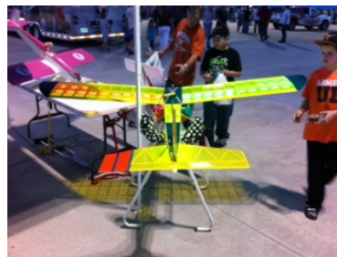
Bryon's rebuilt Senior was a great crowd-pleaser with its many lights and transparent covering. That should prove to be quite a sight in the air after dark! Great Job Guys!!

land-locked planes and a couple floaters, along with the infamous BCFO-Star! Bryon's lit-up Senior caught a lot of attention!